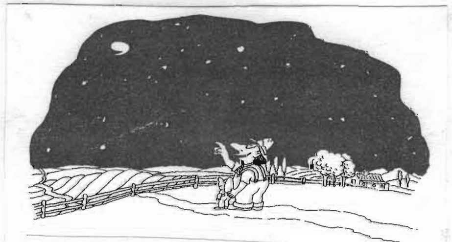
"That's Halley's Comma"

Perhaps a final showdown between the 'last battalion' and the current political system will be a battle waged with flying saucers and space-based weapons systems. What part will the peaceful scientist-philosophers of the Secret Underground City of the Andes play in the coming changes on planet Earth?